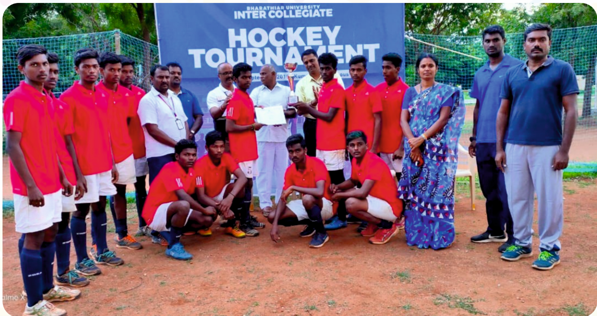
Bharathiar University inter-collegiate hockey tournament was held at Kumaraguru College of Liberal Arts & Science Coimbatore on 5th September 2019 and won the overall runner-up.