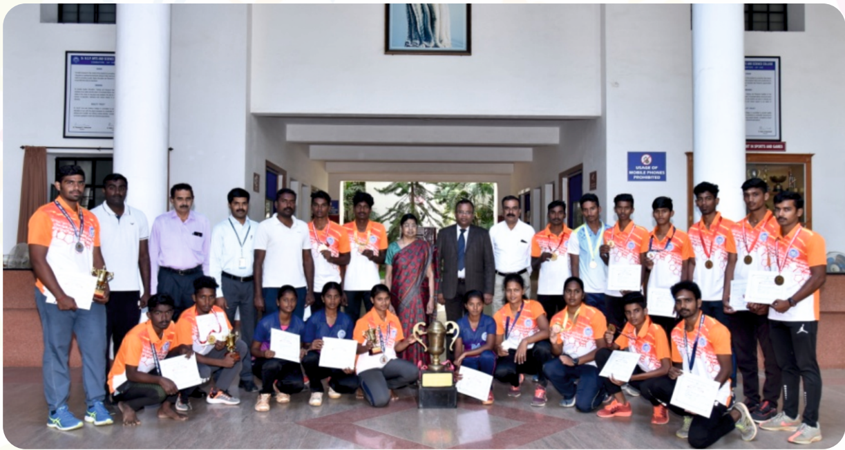
Inter-collegiate athletic meet for Men, Bharathiar University 2019-2020 was held at Nehru stadium Coimbatore on 12th December 2019 and won the overall championship