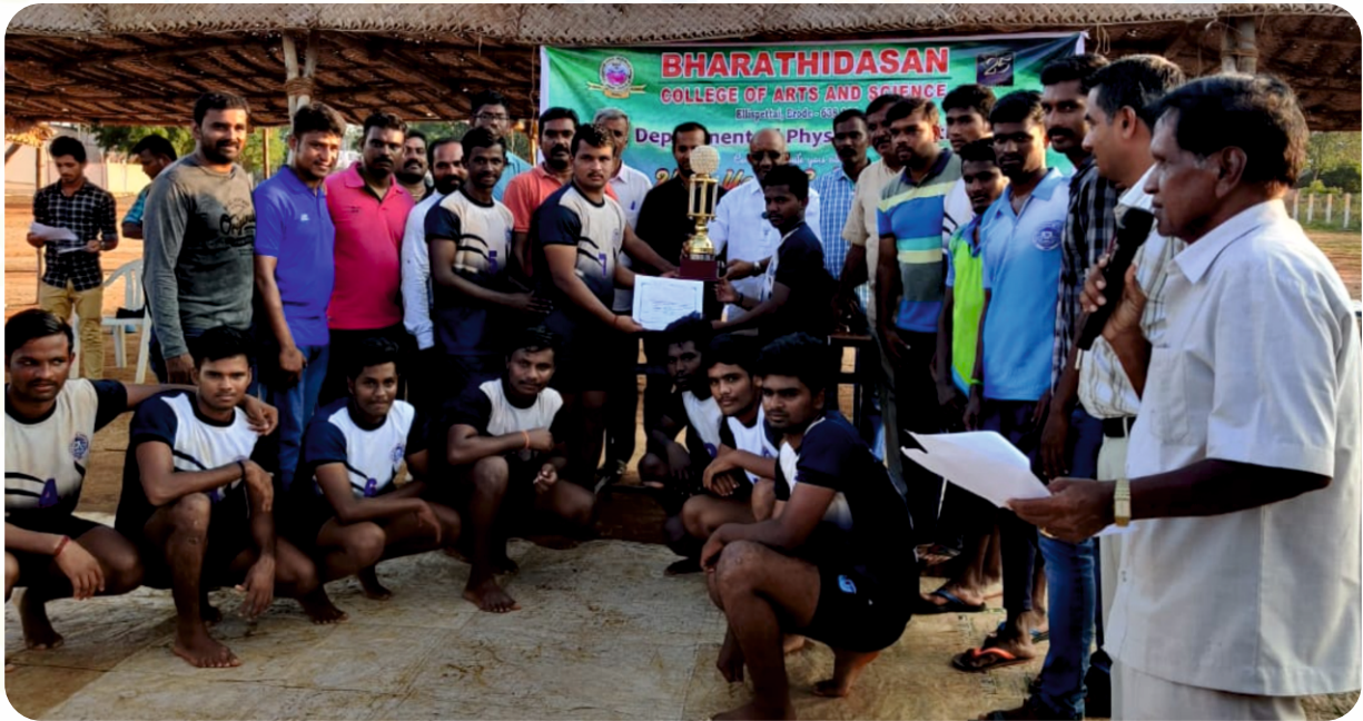
Inter-collegiate kabaddi tournament, Bharathiar University 2019 was held at Bharathidasan college of arts and science, Erode on 12th October 2019 and won the overall championship