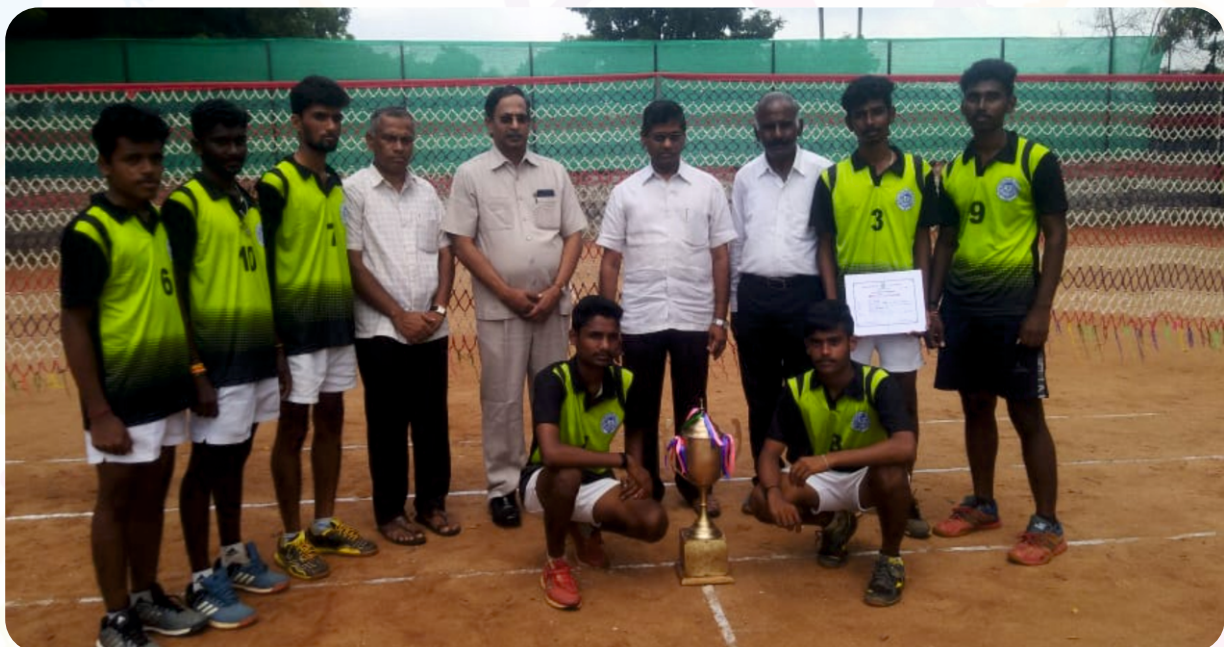
Inter-collegiate ball badminton tournament, Bharathiar University 2019 was held at Sree Saraswathi Thyagaraja College Pollachi, on 12th October 2019 and won the overall runner-up.