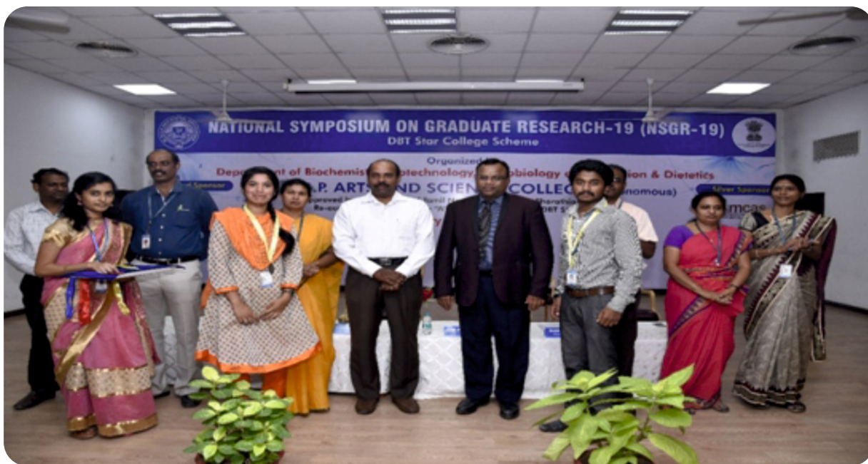
National Symposium on Graduate Research-19 was conducted for graduate students in science and technology disciplines

The Department of Biotechnology (DBT), Government of India, New Delhi, has launched Star College Scheme with the aim of strengthening life science and biotechnology education and training at undergraduate level. DBT under the star college scheme sanctioned an amount of Rs. 82.00 lakhs for three years to the bioscience departments-Biochemistry, Biotechnology, Microbiology, Nutrition and Dietetics. The objective of the star college scheme is to strengthen the academic and physical infrastructure for achieving excellence in teaching and training. To Enhance the quality of learning and teaching process, it is stimulated original thinking through 'hands-on', have an exposure to experimental work and made participation in summer schools.