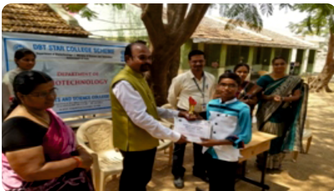
The celebration of National Science Day 2019 at Pandinagar government secondary school by Biotechnology Students and Staff members