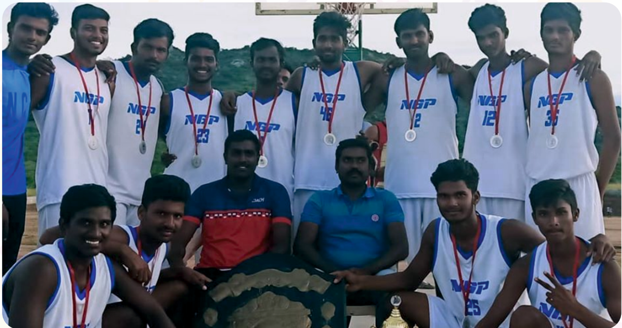
Bharathiar University conducted inter-collegiate basketball tournament and won the overall runner-up at Sri Krishna Adithya College of arts and science on 16th October 2019 at Coimbatore.