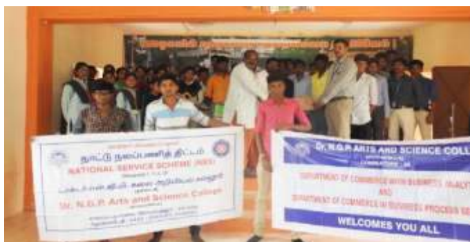
Orphanage Visit On 10-12-2016