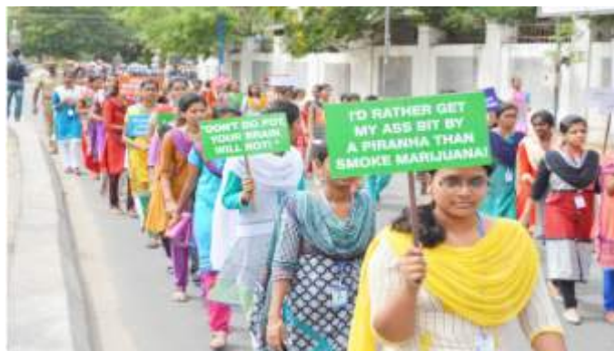
International Day Against Drug Abuse Awareness Rally on 27-06-2016