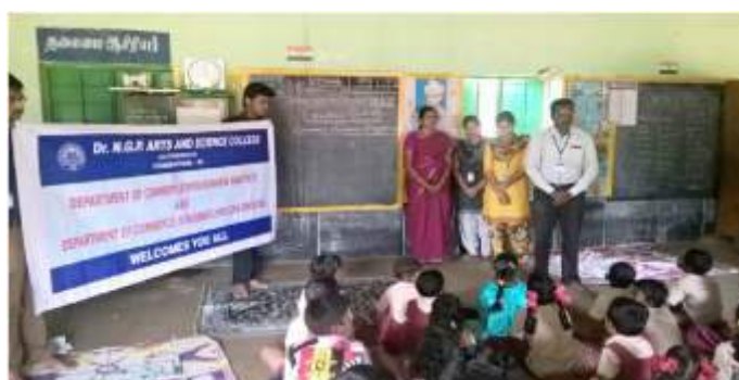
Consumer Awareness Programme On 10-01-2017