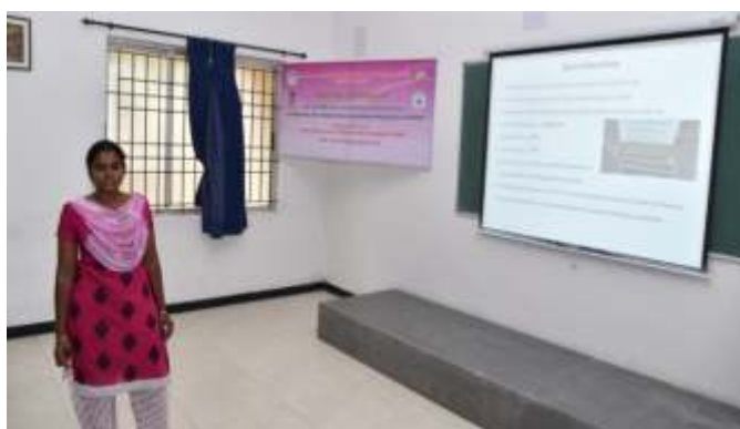
Participants of various events during the Symposium on 09.09.2016