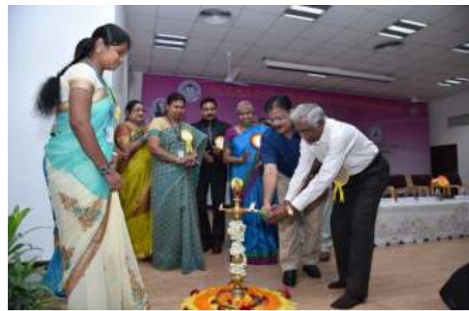
Inauguration of Louis Pasteur Memorial Symposium & 14th Indian Association of Applied Microbiologists Conference on "Transitional and Translational Scenarios in Biological Sciences 3I- In vitro, In vivo and In silico" on 9th&10th Sep. 2016.