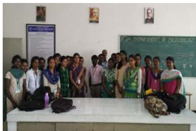
Consultancy rendered to under graduate students of PSGR Krishnammal College for Women