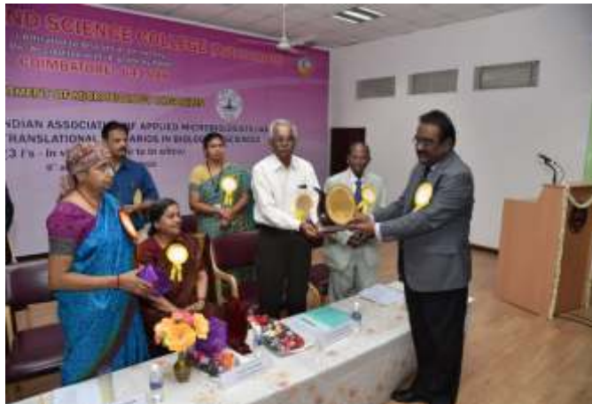
Glorification of the chief guest