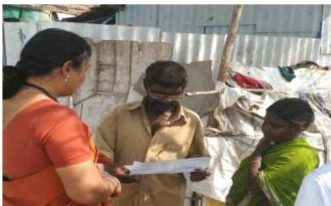
Awareness program on TB for General public at Ambedkar Nagar, Coimbatore on 09.01.2017.